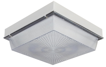
White housing version