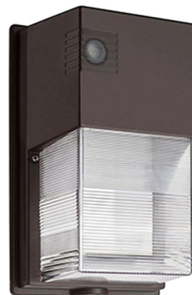
Designed for this type of wall pack - 10.875" long x 6.875" wide x 5.25" deep with Polycarbonate Lens

Order Matrix example = MLRPM2-230P (2 panel version in 3000K with photocell)